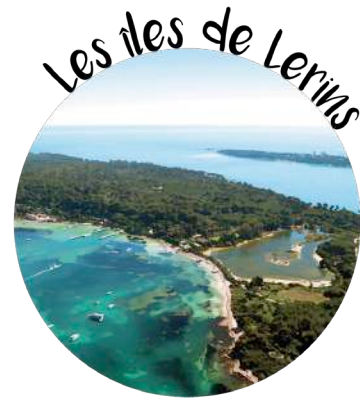
Les îles de Lerins

4 GENERAL ENGLISH OR FRENCH GROUP LESSONS (3H00) FROM 9.00 TO 10.30 AND FROM 10.45 TO 12.15